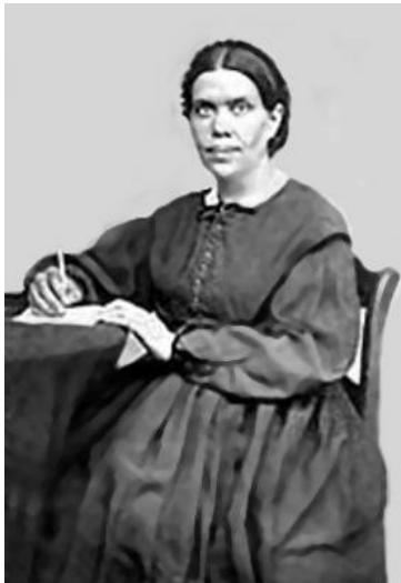
Ellen G. White